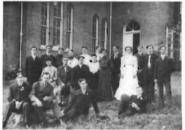
Danville Central Normal College—1906