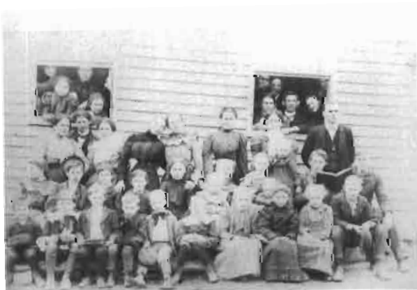
German Ridge School