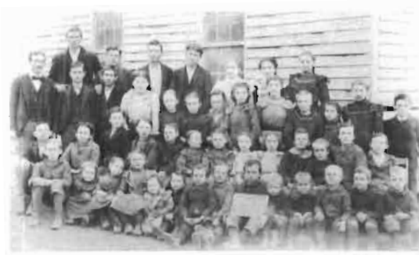
Oil Township School