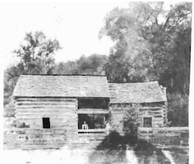
Robert Whitefield Reilly Tavern